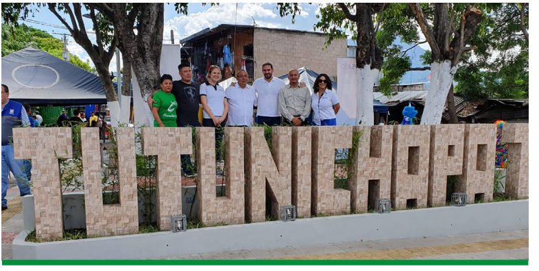
New entrance sign for Tutunichapa neighborhood, San Salvador, 7.19.

windows. Thank you to all who gave to this project.