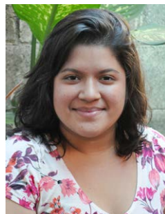
Gabriela Rodríguez Academy of Cuisine