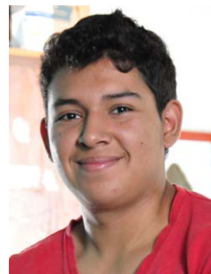
Kevin Molina Academy of Cuisine