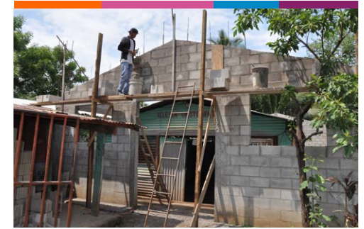
Work progresses on church façade in Agua Santa, Sonsonate, 6.15.