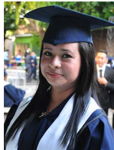
Raquel Olivares Health Field