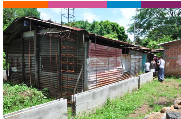
Block walls go up around the rear of the church in Agua Santa, 8.14.

and the workers were busy preparing to demolish the old structure. Thanks to all who gave to this project! It will supply a beautiful, dry and safe place for our fellow believers to worship God.