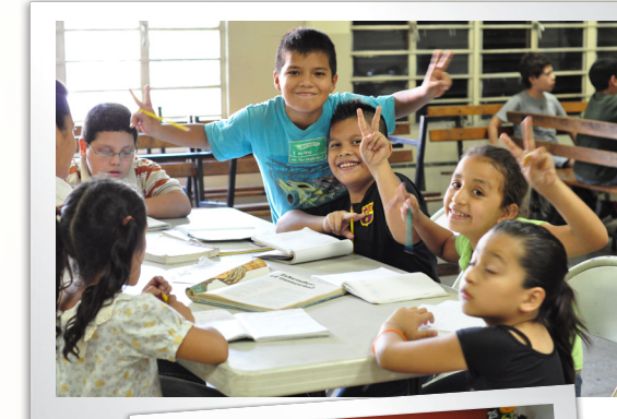
Summer school studies at Cristo Centro, 12.11

stretched out; spare not; lengthen your cords and strengthen your stakes” Isaiah 54:2