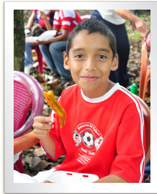
One of the young boys enjoying his breakfast, 8.12